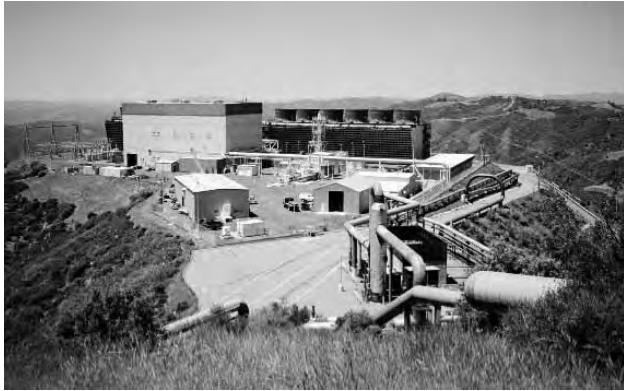
Calpine Power Plant